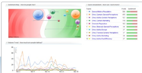
Only TruCast allows you to view dashboards that measure volumes and sentiment of conversations about your brand

Evaluate positive and negative conversation attitudes around each of your topics, within every post and every comment.